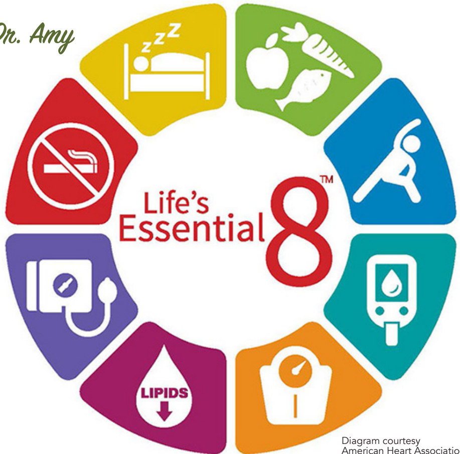
Diagram courtesy American Heart Association.

The connection between periodontal disease and cardiovascular disease is nuanced but is likely driven by inflammation and oral pathogens. The inflammation